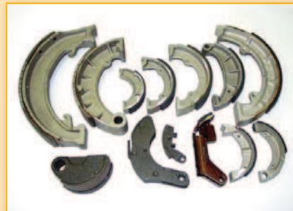
Motorcycles and agricultural machinery brake shoes

A perfect shot-blasting of all the refurbished parts is the basic technological condition.