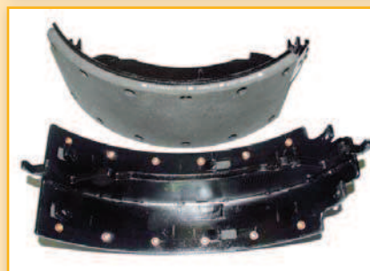
Ford Cargo brake shoes

All the brake parts have to pass special baking process in the specialized hardening oven, while fixed in specialized fittings. The hardening of the glued connection as well is leaded electronically and there are recorded all the unique process.