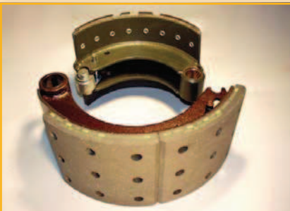
Trucks and trailers brake shoes