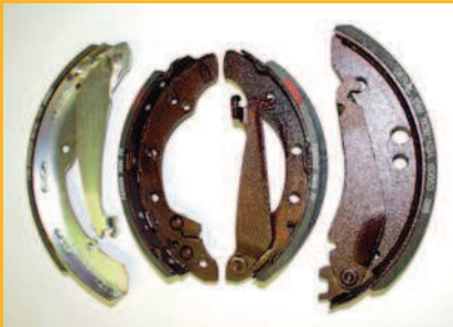
Passenger and commercial cars brake shoes