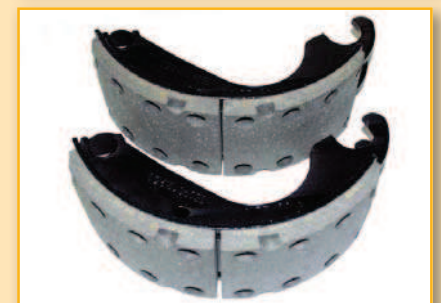
Trailers brake shoes

The brake friction application for firework special car Tatra includes the usage of special compounds with increased temperatures resistance.